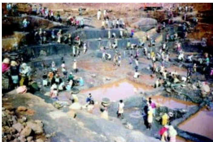
Manual Mining of Chrome Ore

Chromite deposits are mostly located in Sukinda valley of Jajpur district and Boula-Nuasahi belt of Bhadrak district. These are mainly associated with laterite, altered, ultramafic rock, nickeliferous limonite and talc serpentine schist. The processed ore through the region is imported to meet the need of Ferro alloys industries in the country. Chromite export from Orissa has been increased from 3.46 lakh tones in 1994-95 to 11.68 lakh tones in 2003-04. The total export from Paradeep Port Trust was 7 lakh metric tones in 2003-04 (Table-IV).