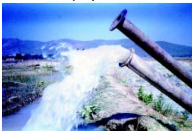
Mining water being pumped out

For quite sometime chromite matrix was considered to be most stable and chromium pollution due to chromite mining or handling was thought to be impossible. Recent studies reveal that Chromium is lodged in Chromite gets oxidised by various physico-chemical and biological processes.