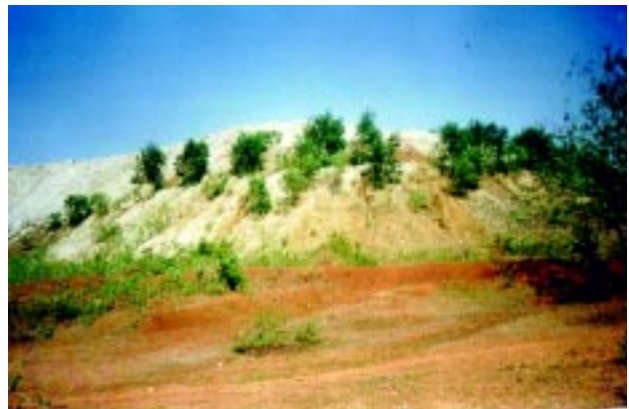
Plantation on Overburden Dumps to reduce soil erosion

Apart from mine water drainage the over burden dump has a huge potential of polluting the surface water. In Sukinda valley of Orissa, mines dumps are located through out this area and even