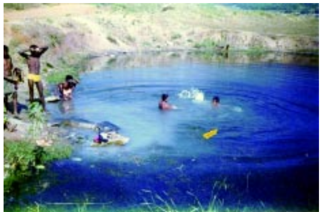
Mine Water flowing through an abandoned mine being used for bathing

near banks of Brahmani River. Over 30 million tones of over burden (rock waste left behind after the ore is removed) has been discarded so far.