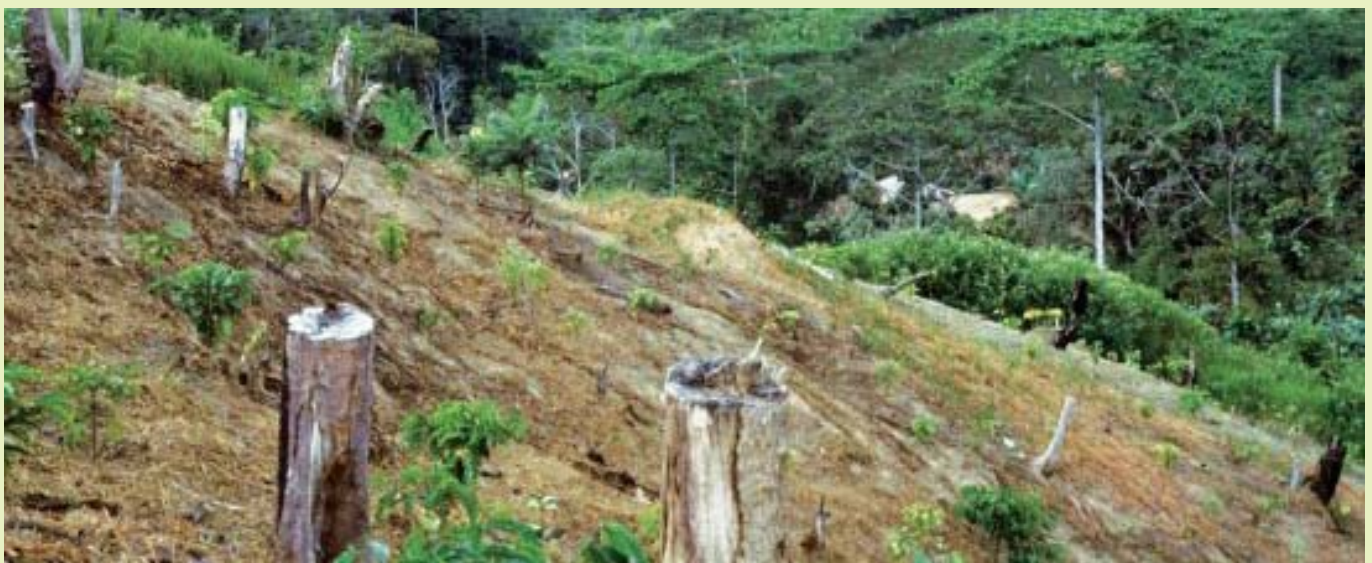
In tropical regions, an area of rain forest the size of a football pitch is cut down every second.

Man is an integral part of the environment. Quality of life depends on the quality of the environment. Therefore it is essential to manage, preserve it for our own survival. Management is a discipline by itself growing rapidly and in no way it proposes to halt economic growth whilst conserving the scarce natural resources and protecting the environment.