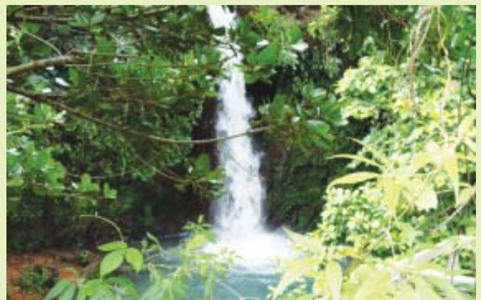
Forests protecting the components of bio-diversity

Analysis of satellite photographs reveal that about 19.4% i.e., about 64 million hectares of the geographical area of our country is at present covered with forests. After independence, developmental activities were given priority. Conservation of forest received little attention. Large scale destruction has resulted in the loss of about 4 million hectares of natural forests, since 1950. Increased use of wood, timber or other forest products, without adequate efforts to regenerate them, is reducing our forest resources, resulting in environmental imbalance. As per the State of Forest Report 2009, published by Forest Survey of India, Orissa has got forest cover of 48,855 sq. kms. which is 31.38% States' geographical area. Area spread wise, it ranks 5 th in the country. Madhya Pradesh has got the largest forest cover in the country, followed by Arunchal Pradesh, Chhatisgarh, Maharastra and Orissa.