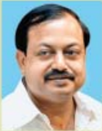
SHRI DEBI PRASAD MISHRA Minister Forest & Environment, Orissa